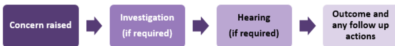
Figure 2: key stages of the process for addressing concerns

68. The following process will usually apply: