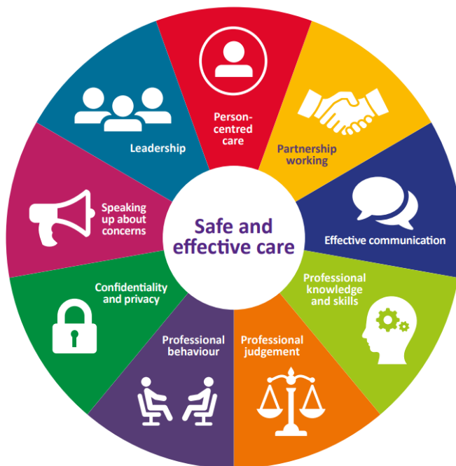
Figure 1: The standards for pharmacy professionals